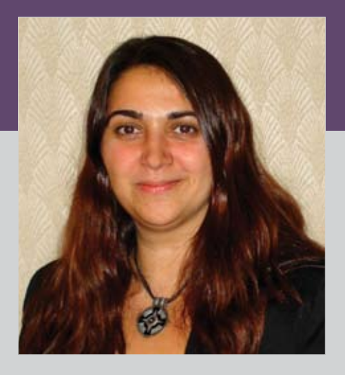
I look forward to continuing to represent APSSP members in this group and to ensuring that we all have safe and healthy workplaces.

establish a joint task group around violence in the workplace. Since that time, the Ministry has convened the Joint Task Group on Workplace Violence and APSSP was invited to participate in this group. The purpose of the group is to examine the issues around workplace violence in schools. It will also review exemplary policies and procedures, pertinent legislation, appropriate training, and the role of Joint Health & Safety Committees. This Committee is sharing the information with the Ministry of Labour.